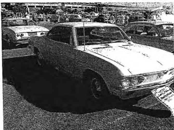
This nice '66 coupe belongs to Bruce Robinson. It's been to the Casa Show several times.