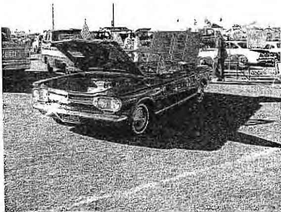
The center piece of our display was Ed Segerstrom's '64 convertible.