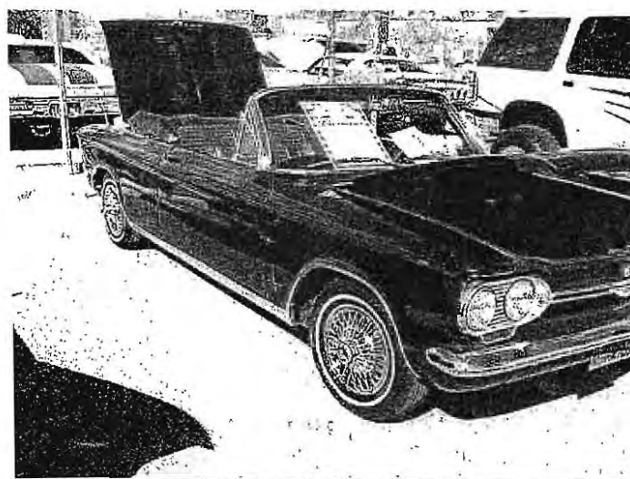
This was the only Corvair at the Show that was not in the TCA display.