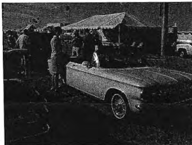
Chris Cunningham's '64 convertible was one of several early model convertibles in attendance.