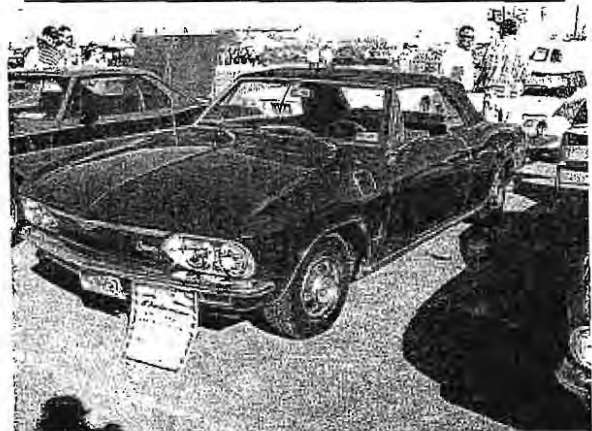
Lance Gillingham's '66 convertible was a nice addition to this year's display.