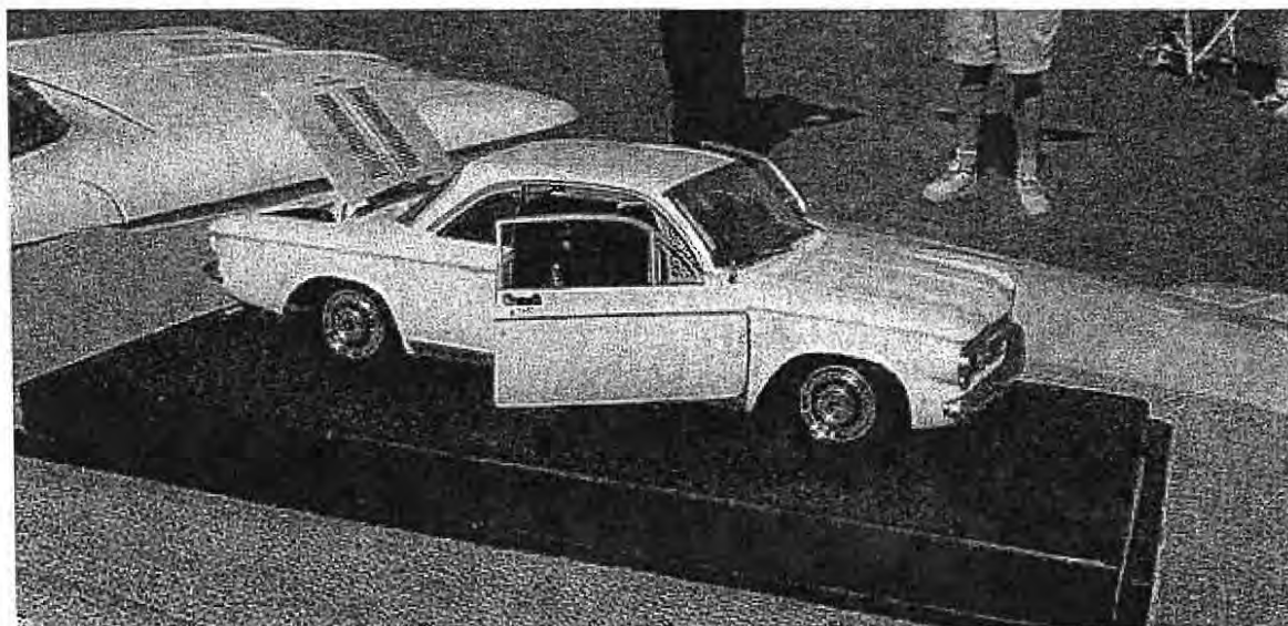
This was the smallest and cleanest Corvair at the show. Emily Campbell had it on display on top of here 4-door.