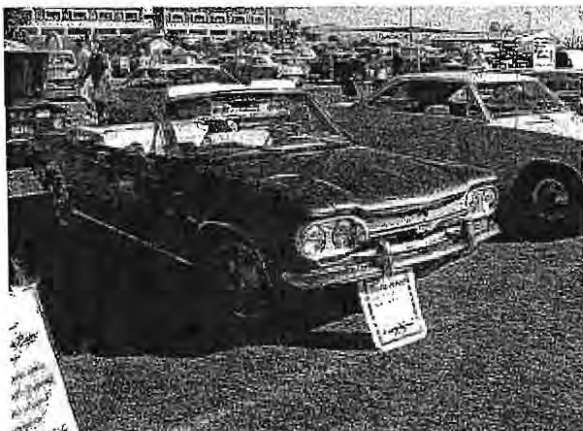
As always, Dawn Elvick's '64 convertible was there in all its glory!