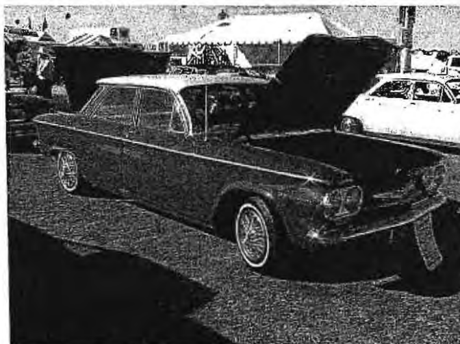
Allen Elvick's '60 4-door was the only 1960 car on display. There is always a soft spot in our hearts for the very first Corvair.