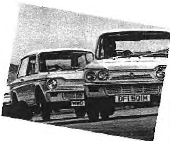
Left: In front (twin headlights) the Singer Chamois Sport and right behind it the Sunbeam Imp Sport.

After the tuning firms like Hartwell's had had a go at the Imp's eager engine to produce road-going quick Imps, Rootes left it quite late to produce their own sporting model. It took about two years to develop it, but finally... October 1966 saw the birth of both the Singer Chamois Sport and the Sunbeam Imp Sport.