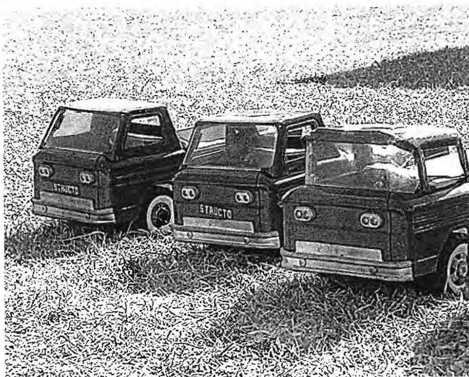
On your mark, get set, go!