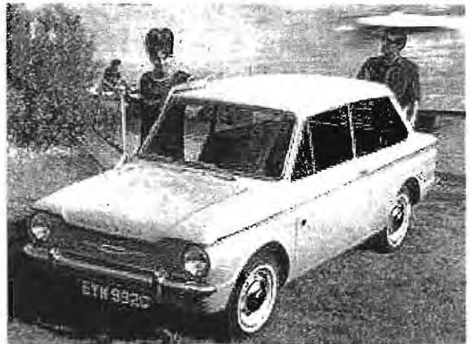
Above: Imp de Luxe, produced from May '63 to Mar '76. Advertised in Belgium as 'a youthful, dynamic car for hip people.'

Imps were built in a specially designed plant in Linwood, Scotland. The Rootes Group produced 440,000 of these extraordinary cars.