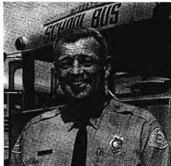
"Our engines 'went to school' with Frantz ...for a big savings!"