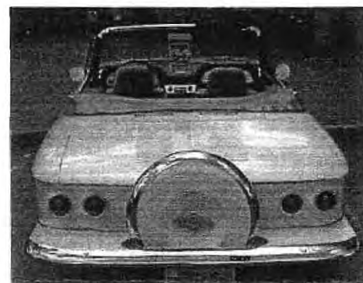
Say it with a continental kit. One of a kind!