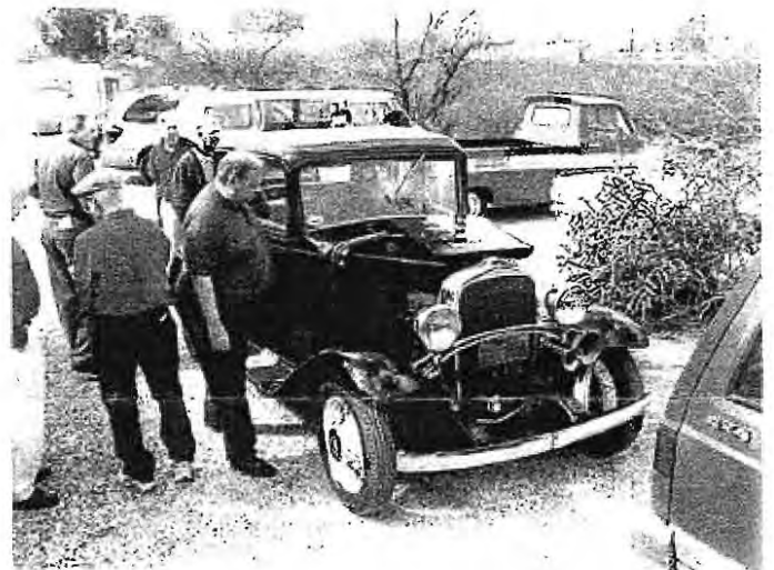
Ed Segerstrom's '32 Chev Confederate Rumble Seat Coupe draws a big crowd.