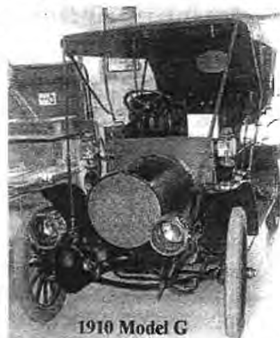
1910 Model G

"The Foundation shall recondition and refurbish as needed, maintain and display for public viewing the antique Franklin automobiles in Trustor's collection and shall preserve, maintain and provide