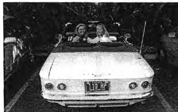
It doesn't get much better than this!