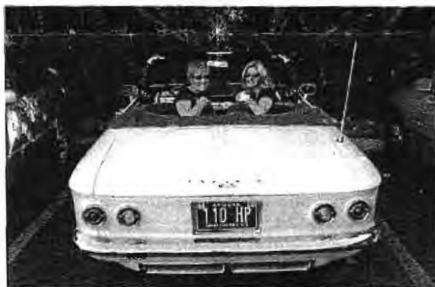
Hot chicks in a hot car! Still looking good 30 years later.