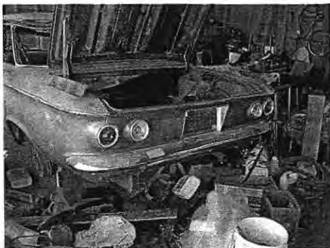
1960 700 Sedan gathering dust somewhere in Tucson