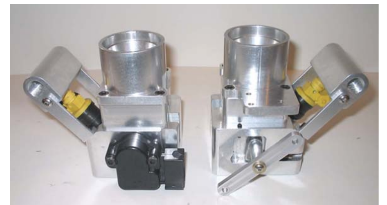
These throttle bodies use the original throttle linkage crossbar and air filter.

RH Throttle bodies are now available. The introductory price of $900 per pair is valid until June 1, 2008. Black Hawk Engineering is Chuck Riblett's part-time business in Loveland, Colorado dedicated to designing and fabricating components for enthusiast vehicles. I have more than 30 years experience in precision mechanical design and more than 35 years experience in modifying and building sports cars, kit cars, hot rods, racecars and motorcycles. www.blackhawkengr.com