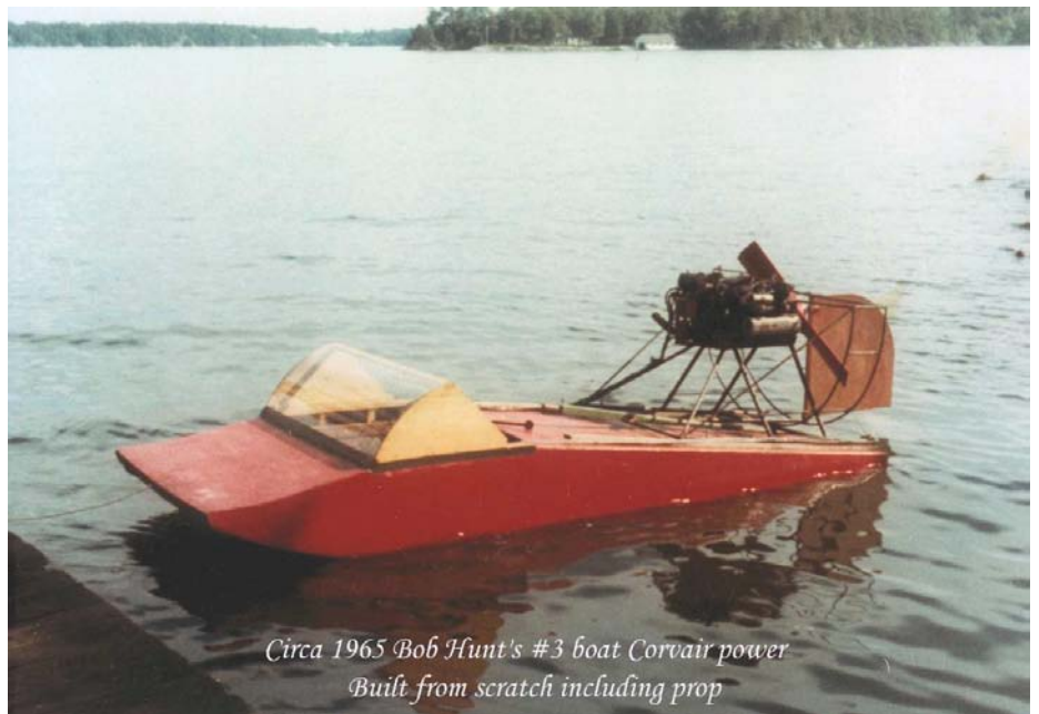
A picture taken around 1965 of a Bob Hunt's scratch built airboat

Back in the 70's Corvair-powered airboats were common down in the south and other places where there is enough swampwater to run an airboat. Today there is a lot talk on the different airboat-related forums about using the engine but very few have actually built one. The occasionally show up on craigslist but Corvair-powered airboats are mostly gone. Above are a couple of pictures taken in 1977 of a boat built by Dan Fralick. Seeing these old pictures and viewing a couple videos on youtube kind of make one wish we had some swampland a little closer.