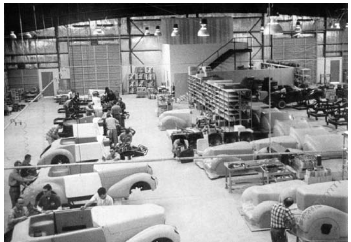
Assembly Plant, Tulsa, Oklahoma circa 1966