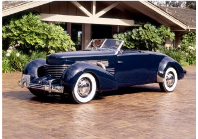
1937 Cord Cabriolet

Though impressive in outward appearance, the underpowered, fire-prone and often controversial Corvair engine along with the car's poor handling characteristics proved too much to overcome. The manufacturing goal of ten cars per day was never achieved and persistent financial difficulties pushed the company into bankruptcy by 1967. However, the car with such a popular and timeless design would never be forgotten.