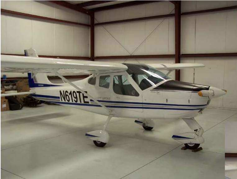
Left: The Young's Technam P92 Echo Super DeLuxe.