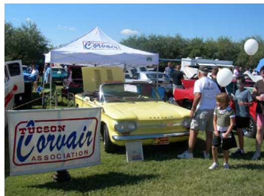
A photo from the 2010 Classics of Tucson Show.

TCA Christmas Party. This year's party will be held at the Taste of Texas Steakhouse, 8310 N Thornydale (at Cortaro). 7:00 PM. See the website for more details.