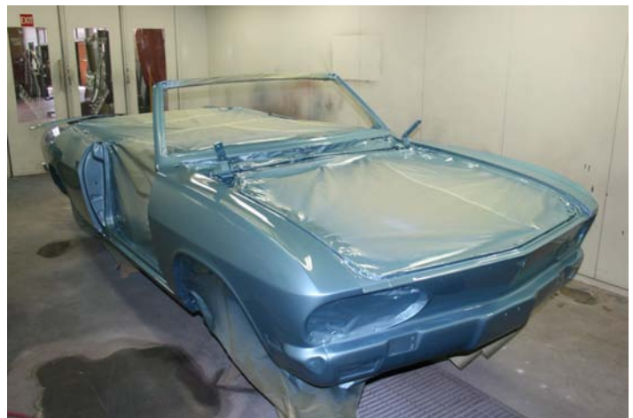
Joe Hiller's '68 Monza concertible progresses nicely. After extensive bodywork, the paint is finally complete.