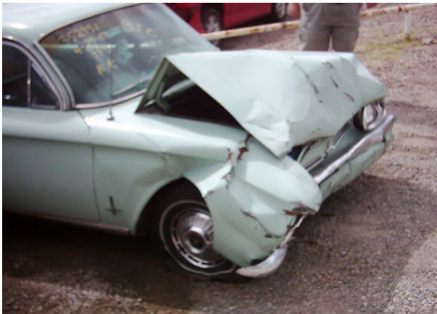
Dave Lynch's car is a friendly reminder to drive safely!