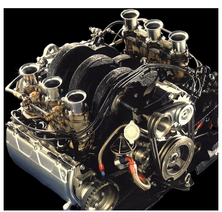
Ultimate GM development of the Corvair engine. Overhead Cam, individual carbs, triple vertical cooling fans. It doesn't get any better than this!