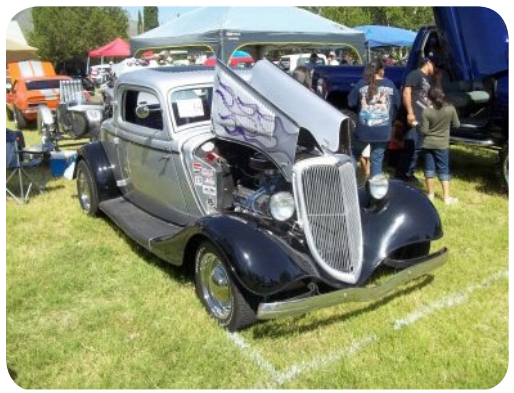
Bisbee Boys & Girls Club Car Show.