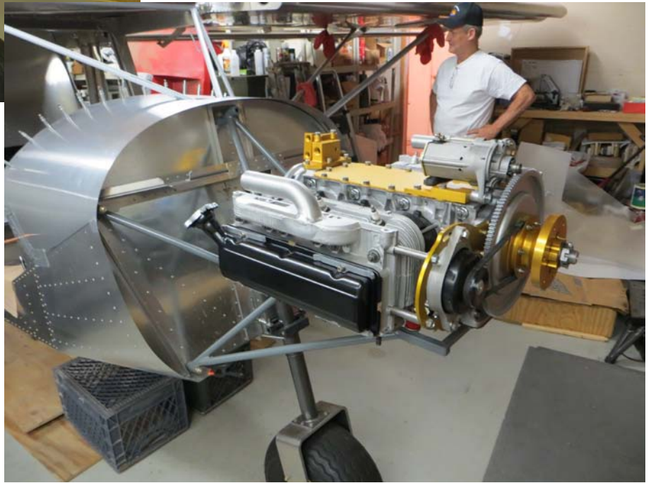
Right: Recently, Ron invited me and a couple of other neighbors over to help him lift the Corvair engine from the work bench to it's final resting place in the airplane. The engine as seen here weighs 213 pounds and will produce about 100 horsepower.