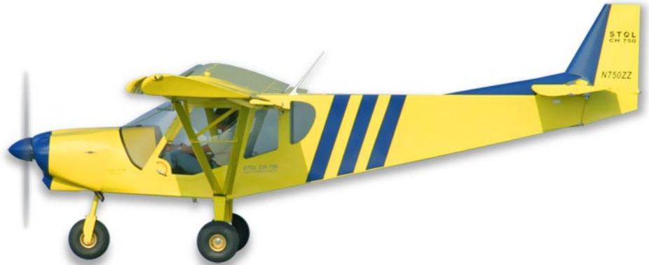
Pictured here is a typical Zenith CH-750. Ron hasn't decided on a paint scheme yet but he's leaning toward something in yellow.

Ron has spared no expense in preparing the Corvair for flight duty. Special parts were available to make it air worthy, such as a special crankshaft bearing that attaches to the prop-end to take care of the extra stresses that the crank sees from the propeller. The intake manifolds have been modified so that an aircraft carburetor can be used. Special brackets are used to mount the alternator and the Subaru starter. The Corvair is anticipated to produce around 100 horsepower. Even though Ron has invested over $7,000 in the engine, it's still a far cry from the $30,000 price of a 4 cylinder, 100 horsepower Continental O-200.