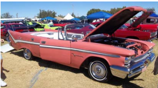
A rarely seen 1959 DeSoto Firedome convertible was at the Sierra Vista show. Two Corvairs could easily fit in its trunk!