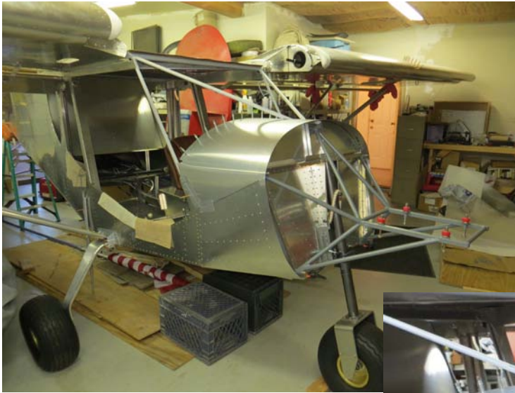
Left: .020 sheet aluminum is used to fabricate the skin of the Zenith CH-750. Ron is just finishing the last couple of pieces to complete the project. The motor mount is ready to receive it's new Corvair power plant. The engine will sit on the four red urethane bushings that can be seen here.