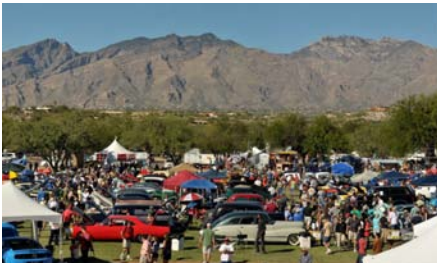
The Classics of Tucson show drew over 400 cars this year.