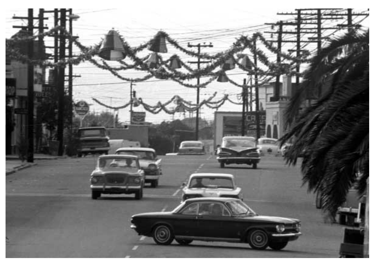
This photo was taken during the Christmas season of 1966. It is not know exactly where the picture was taken but it was somewhere along the central coast of California. The Corvair is, of course, the star of the show but The T-bird, the Studebaker Lark, the '57 Ford, the '59 Chevy and the Chevy pickup make nice co-stars.