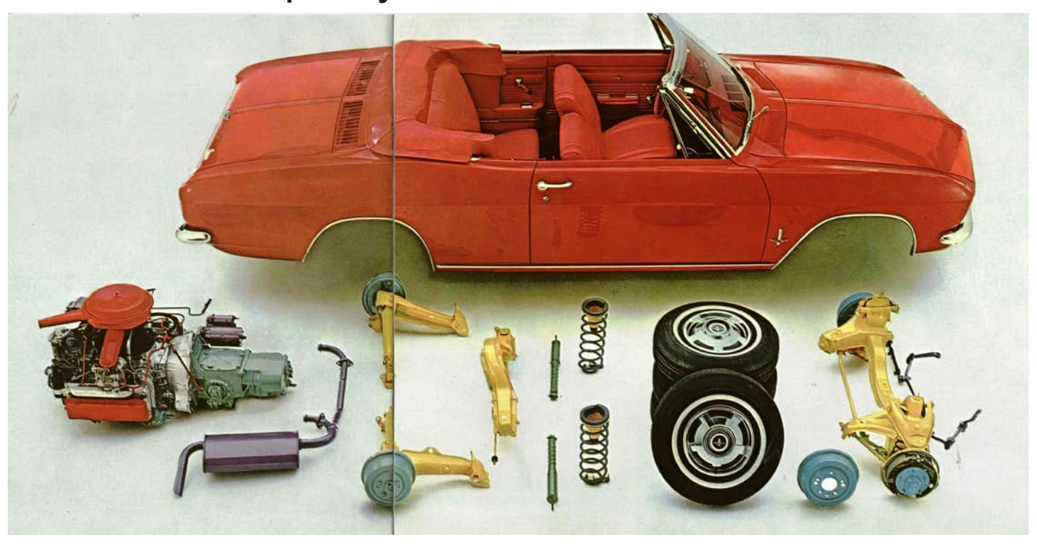
To show the simplicity of the Corvair, this picture was part of the '65 sale brochure