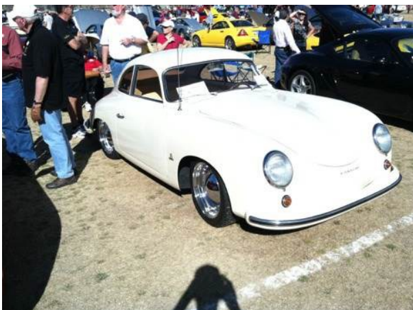
Well, at least the motor is on the right end of the car!