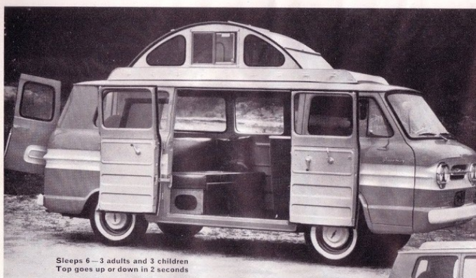
Sleeps 6—3 adults and 3 children Top goes up or down in 2 seconds

Besides these Greenbrier options, the Ultra Van was also listed as the new Go-Home: a major breakthrough in vehicle design and construction.