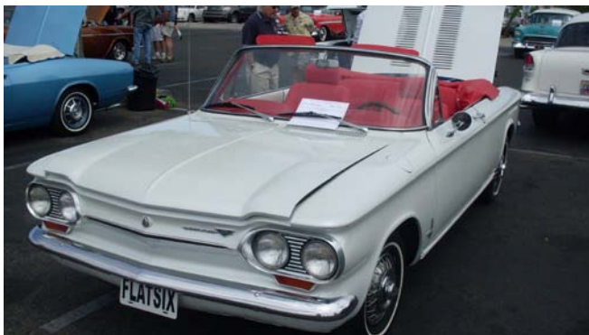
Jim Mills' '63 Monza Convertible