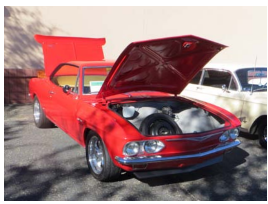
Mike Lake's turbo Corsa was looking good. With new seats installed and sporting a new steering wheel, the car was a great addition to the Corvair stable at the show.