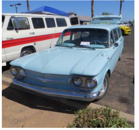
Bill's Lakewood won the 3rd place trophy in the early model car class.