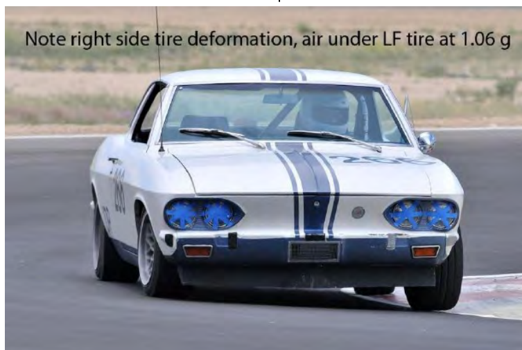
Note right side tire deformation, air under LF tire at 1.06 g

I can attest to at least one 1966 Yenko Stinger that generates 1.05 g (39.7 MPH) on a 200' skid pad, which keeps it right up there with today's Corvettes. That's one of the most amazing attributes of Corvairs: Even 50 years later, they can still ride and corner like new cars. That's what attracted enthusiasts to the cars in the Corvair decade, and it's what keeps many of us hooked today.