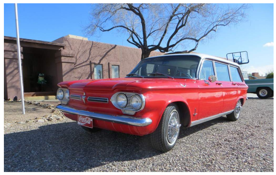
When she saw the finished product, daughter Lisa said she was going to send the picture to Coca Cola. A few days later a Coca Cola license plate was installed.

The car is equipped with the 145 cid, 102hp engine and a 4-speed transmission, and 3.27:1 differential gears.