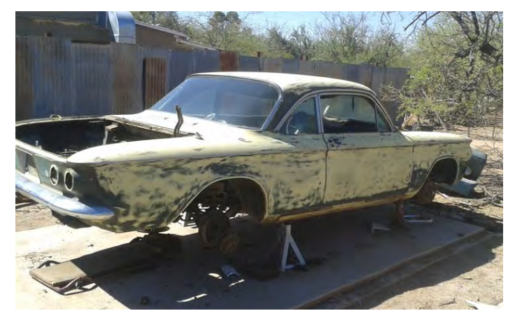
The club project car is in the process of being sanded down and readied for the first coat of primer. Come join the fun!!