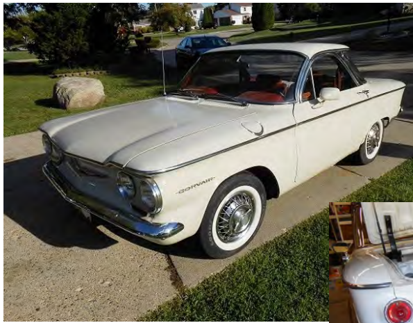
"Stubby" has been around for several years and has changed hands several times. Mods include 5-lug wheels and FC rear axles, to mention a couple. It was recently listed on craigslist and sold to a collector in Southern California.