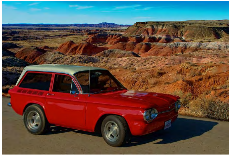
Here are a few other examples of Corvair that have been shortened.