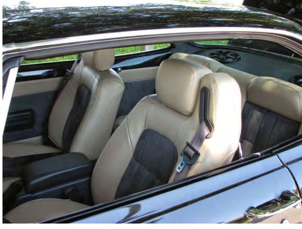
A set of stock Sebring seats (above left). A set of Sebring seats that have been modified for a more conventional look (above). A nicely reupholstered stock set installed in a late model coupe (left).