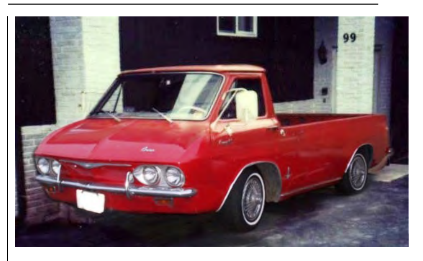
One day fellow Corvair enthusiast, Matt Nall, had way too much time on his hand and spent a little too much time playing with Photo Shop.