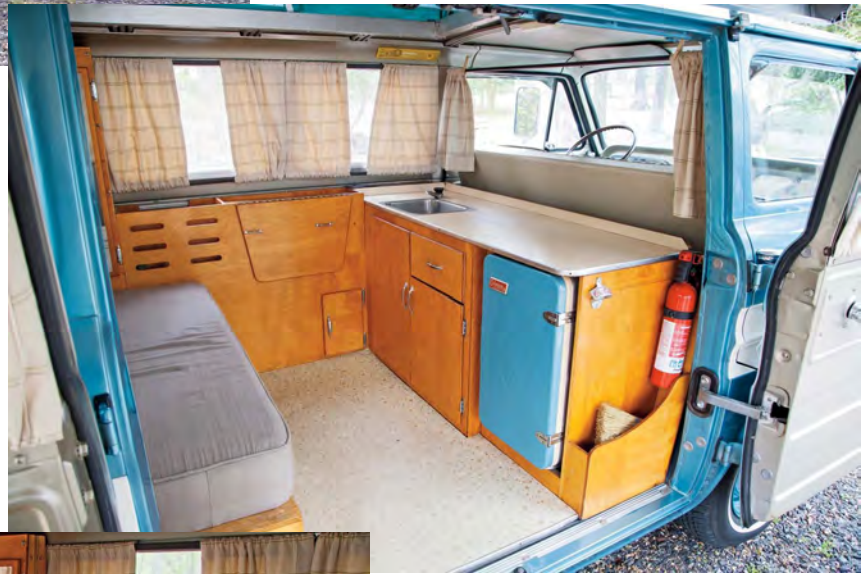
1964 Corvair Greenbrier Camper