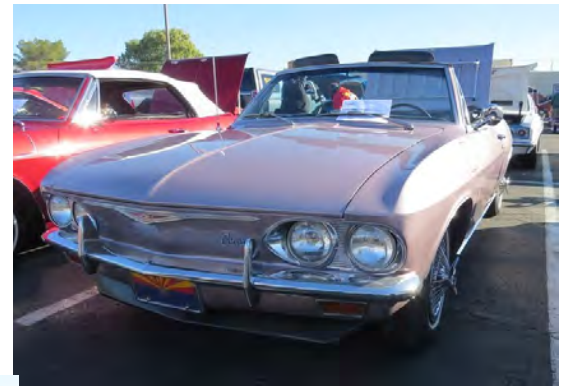
Ron Bloom's '65 convertible