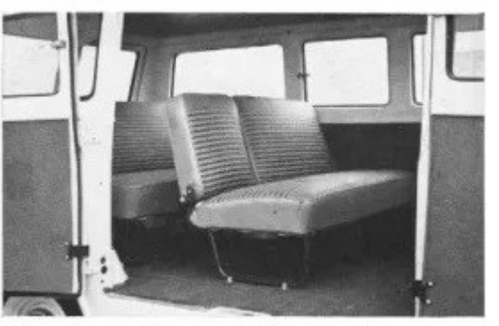
". . . and leave the driving to us." Interior of Econoline.