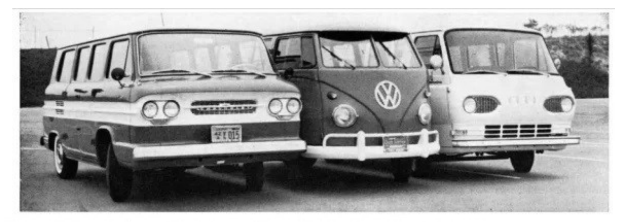
Ford, with front engine, is easiest to load from rear. Greenbrier and VW have step-ups over the engine.

Just a few pictures to highlight the article