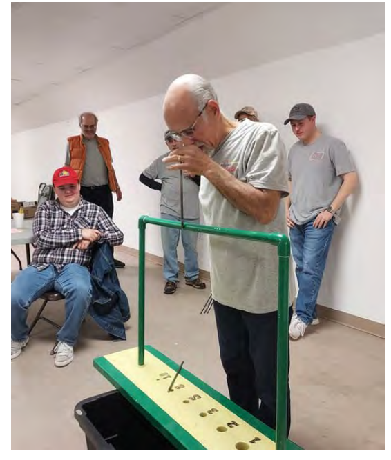
Corvairsation 2Q2023 4