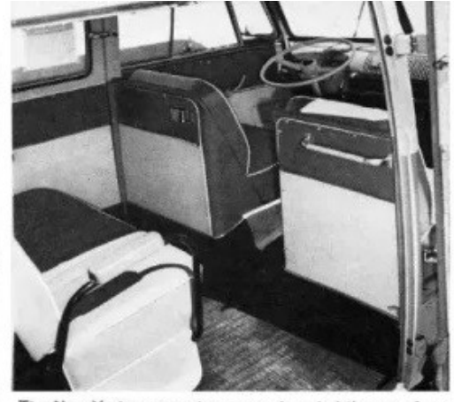
The New Yorker magazine once advocated the use of VW buses as taxicabs, due to their ease of entry.