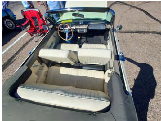
Pat Croan's 1962 Spyder convertible