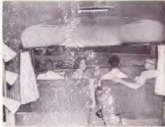
Large windshield incorporates Chevrolet step-van wrap-around sections.

The GO-HOME is a self-propelled, high performance complete mobile home which the average person can afford to buy and to operate.