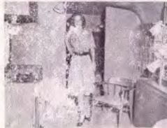
Kitchenette includes, oven, broiler, gas refrigerator.