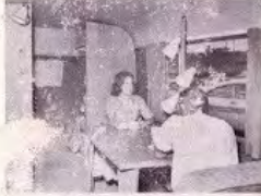
View toward rear right. Bedroom at rear.