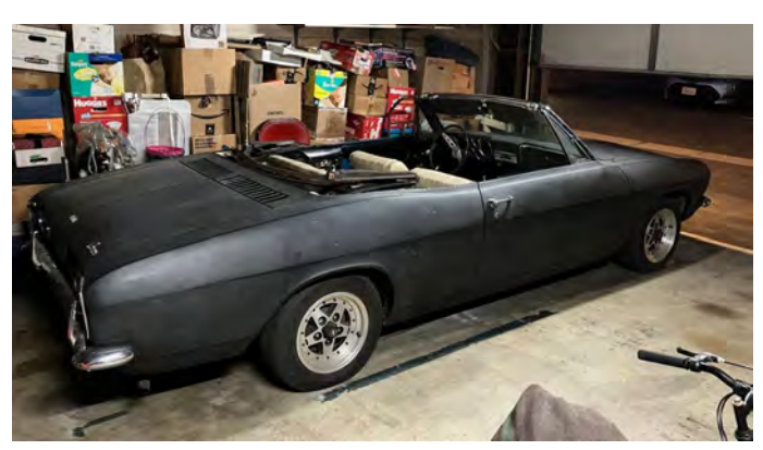
For the complete article click here