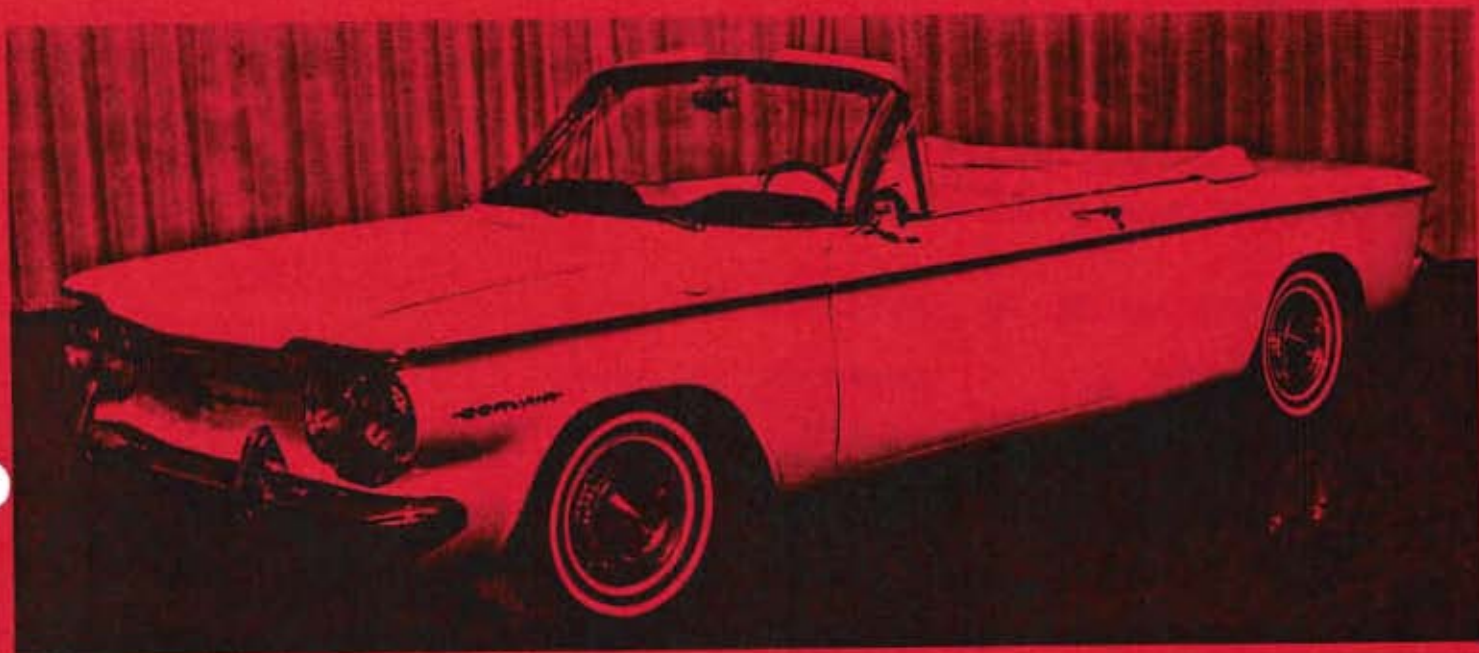
"Pinky" - The First Convertible

See complete article in the January 89 CORSA Communique