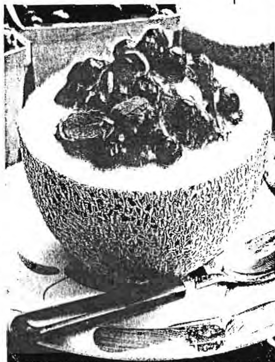
FLYING FRUIT. Filled with ice cream, Cantaloupe a la Mode (recipe far left) fixes fast.

tainer; cover and process on high until smooth. Pour into glasses. Refrigerate any leftovers. Yield: 4-6 servings