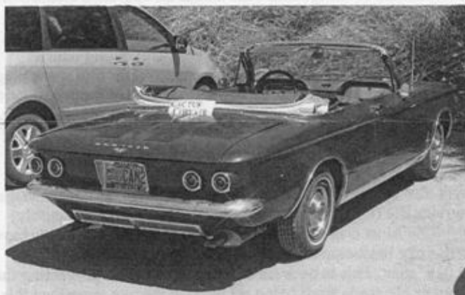
One of two early models driven to the event by a member of the Cactus Corvair Club.