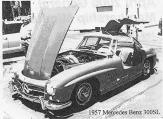
1957 Mercedes Benz 300SL

26 WED Regular Monthly Meeting Micha's North, 1220 East Prince Road, 6pm. Optional dinner at 6:20, meeting starts at 7pm.