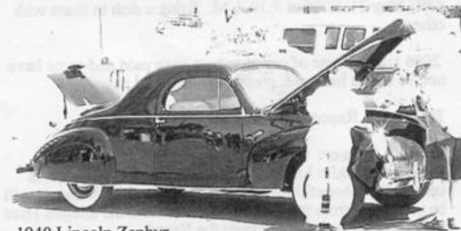
1940 Lincoln Zephyr