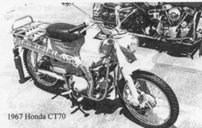
1967 Honda CT70