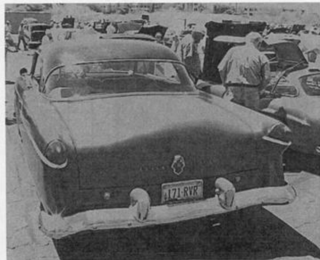
A frayed 1955 Packard Clipper, but in good company, at the AACA meet at the Tucson Hilton East on April 22.