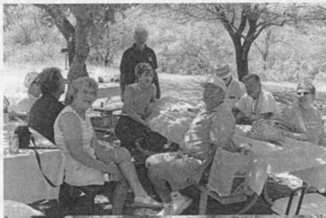
Lunch was enjoyed in the well-shaded picnic area of the park.