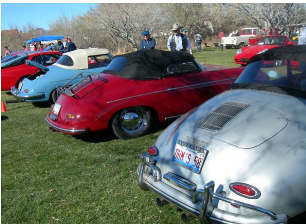
Three early Porsche speedsters (pre As & 356s) at Tubac Car Show in January.