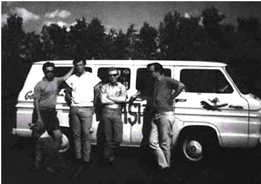
The Trashmen and their Corvair Greenbriar circa 1963.