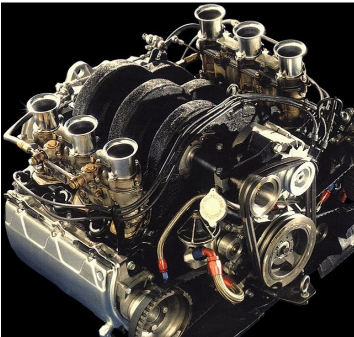
Ultimate GM development of the Corvair engine. Overhead Cam, individual carbs, triple vertical cooling fans. It doesn't get any better than this!