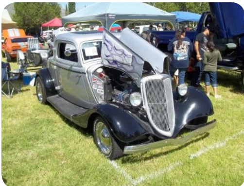
Bisbee Boys & Girls Club Car Show.