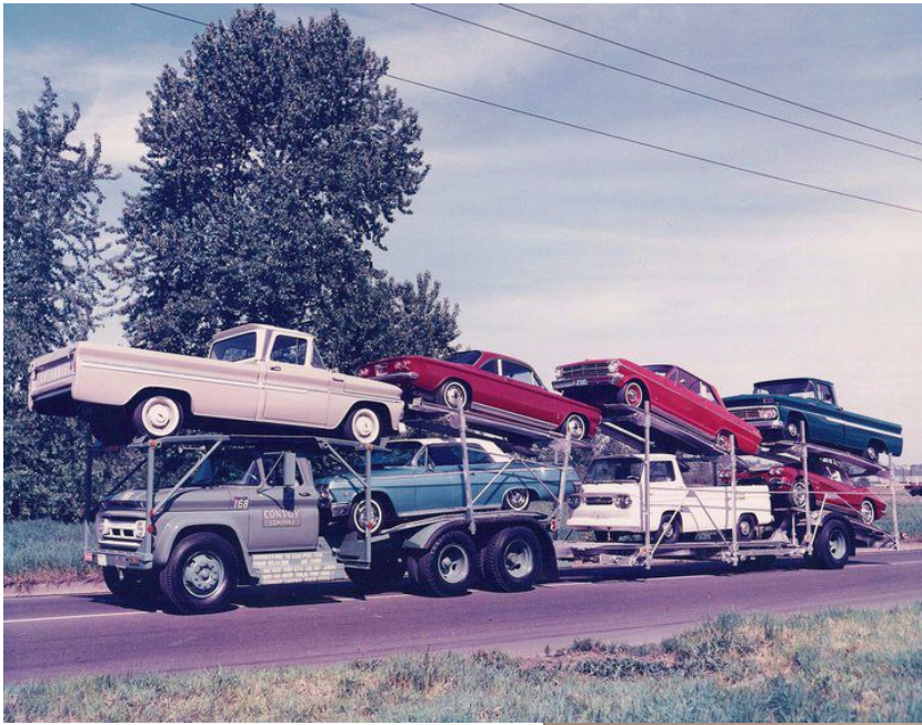
A load of '62 Chevis including two Monza coupes and a Rampside (above). A transporter loaded with 1964 Chevy and GMC pickup trucks (right).

Here are some old photos found on the Internet of car carriers from years of yore.