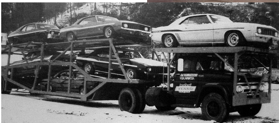
A half dozen Yenko Camaros on a Yenko Chevrolet car carrier. A load like that would easily be worth a million dollars today (above). A Southern Pacific freight train carries hundreds of Chevy pickup trucks in the shadows of Mount Rainier in Washington. These trucks are either 1964, 1965 or 1966 models (right)