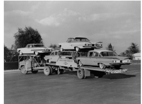
Some 1960 Chevrolet cars on their way to a dealership.