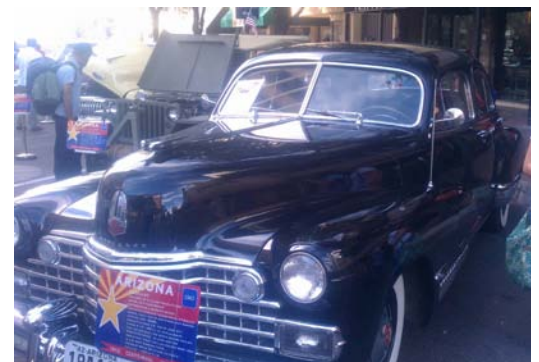
A Cadillac was one of two cars to represent 1942