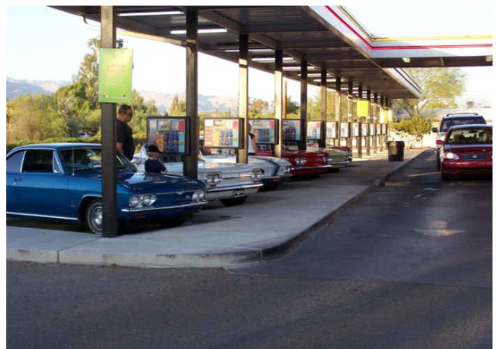
Corvairs at the Sonic Drive-In on 1st Avenue on a cruise night in July 2007.