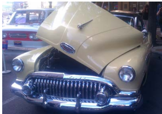
This yellow Buick was the pick for 1952.