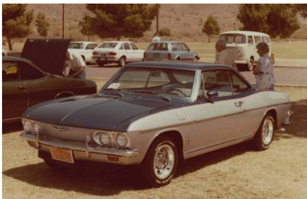
There were many nice cars at the Convention. Unfortunately, more information about the cars is not available.