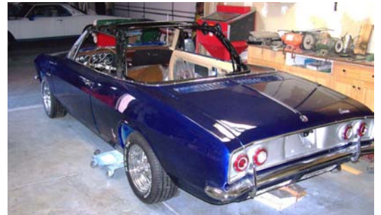
Van Pershing is nearing completion on this '65 Turbo Corsa Convertible.