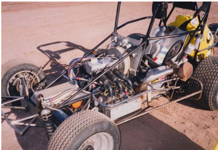
A dirt track race car from years of yore