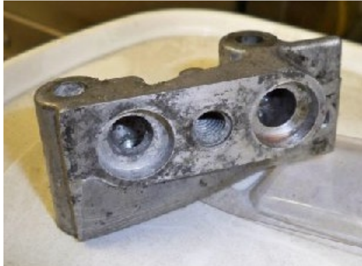
Start with an oil cooler adapter.