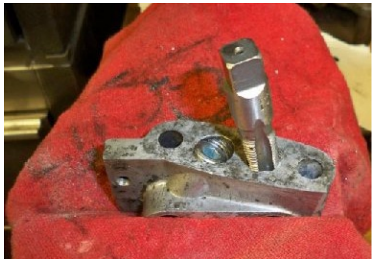
Drill out the two oil passage holes with a 7/16" drill and tap each hole with a 1/4" NPT tap.