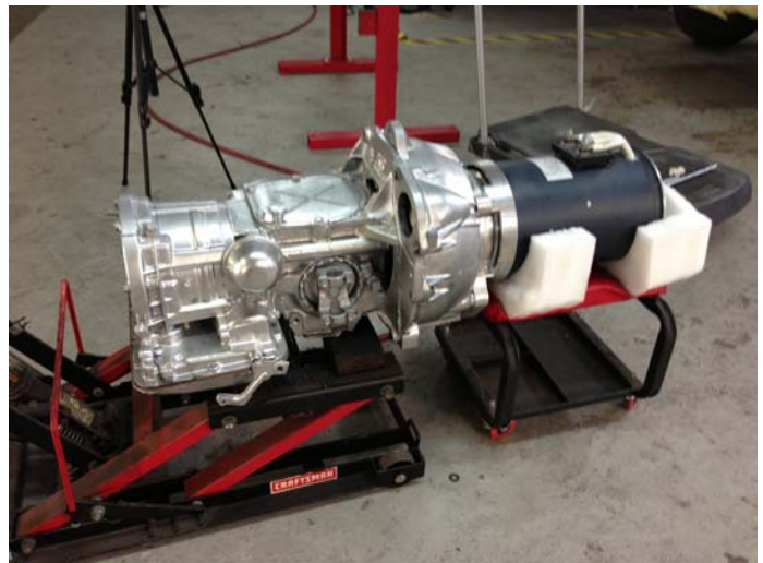
Powerglide transmission mated to electric motor