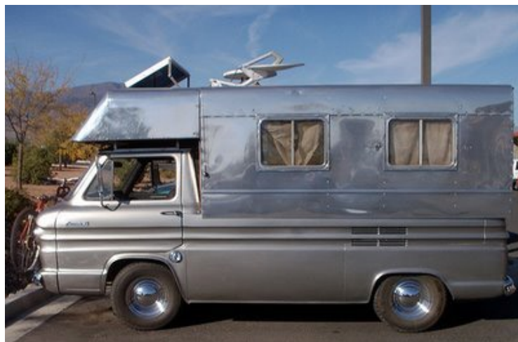
Camping in style!