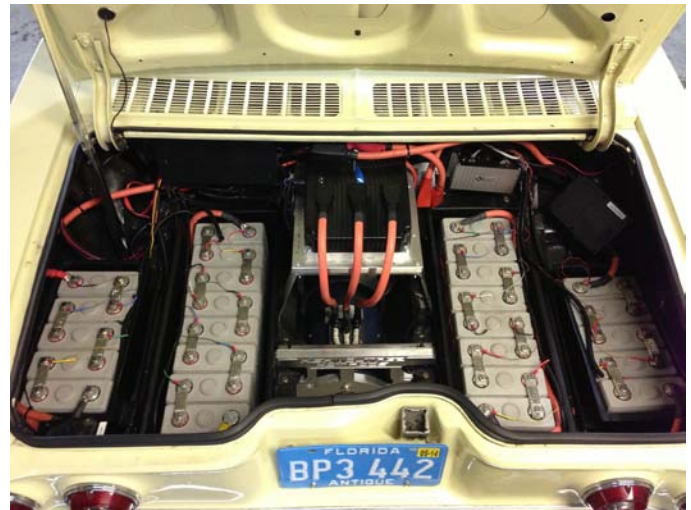
Electrovair Dash with Digital Amp Hour readout.