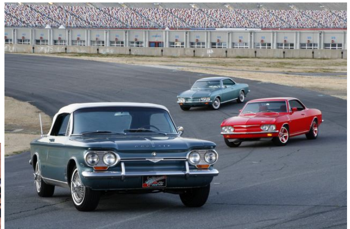
A miscellaneous photo from the archives....