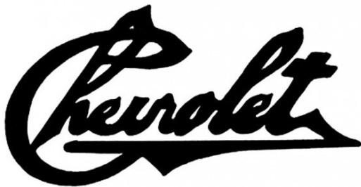
1916 Chevrolet logo