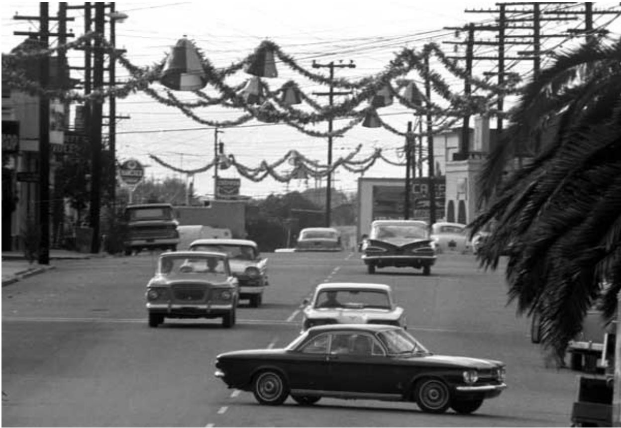
This photo was taken during the Christmas season of 1966. It is not know exactly where the picture was taken but it was somewhere along the central coast of California. The Corvair is, of course, the star of the show but The T-bird, the Studebaker Lark, the '57 Ford, the '59 Chevy and the Chevy pickup make nice co-stars.