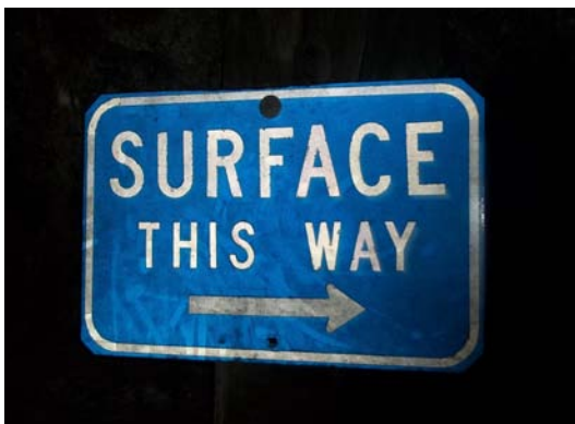
Everybody has on their protective gear for a trip down the shaft