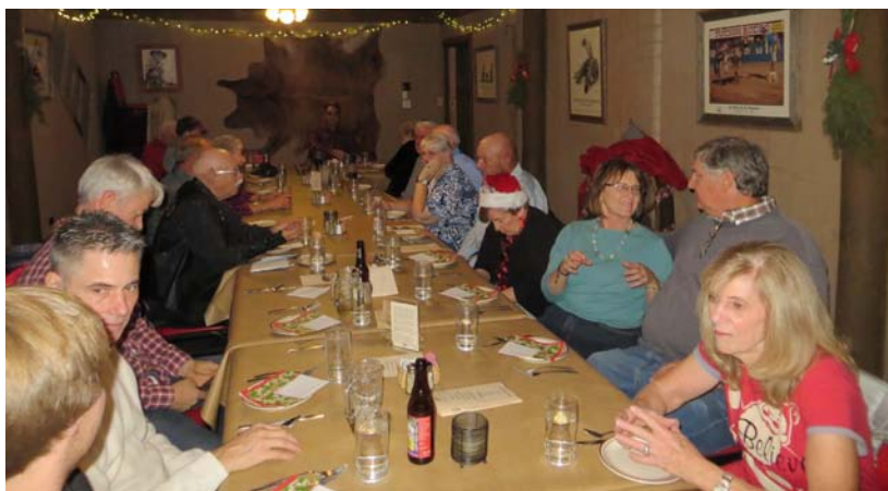
Everyone enjoyed the evening