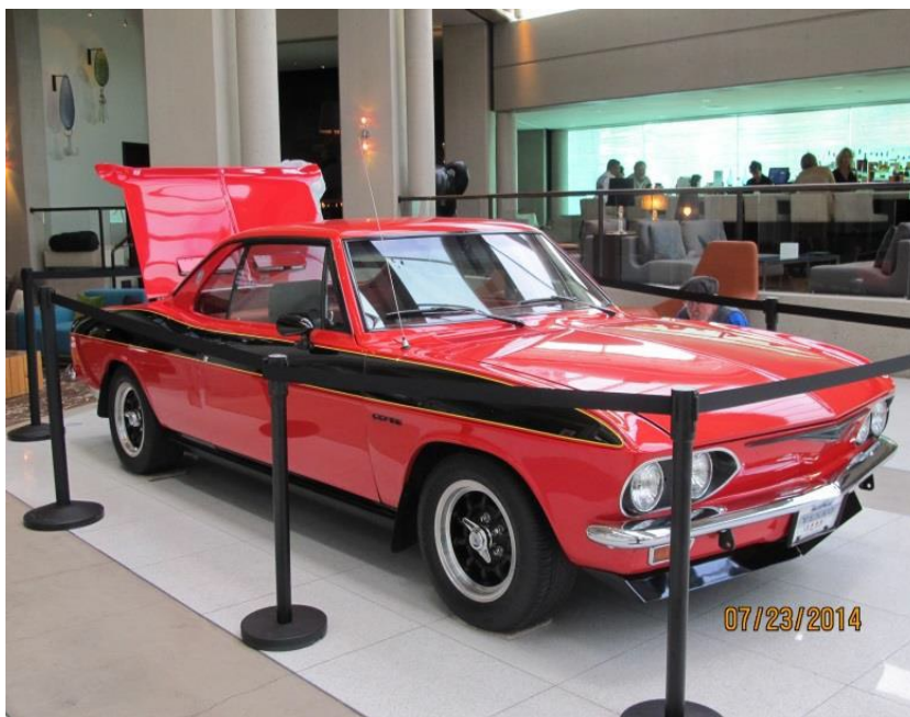
Herb's CORSA was on display in the hotel lobby at the 2014 CORSA Convention.