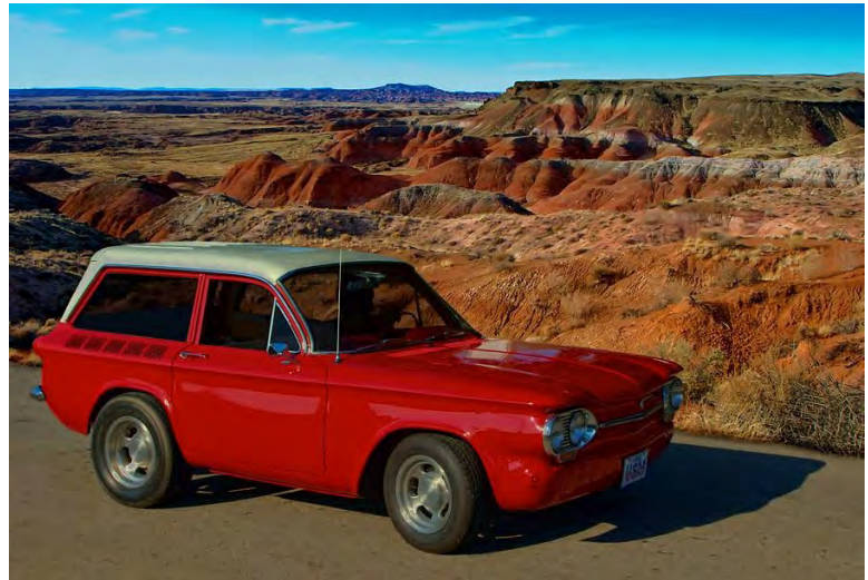
Here are a few other examples of Corvair that have been shortened.