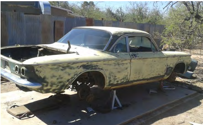
The club project car is in the process of being sanded down and readied for the first coat of primer. Come join the fun!!