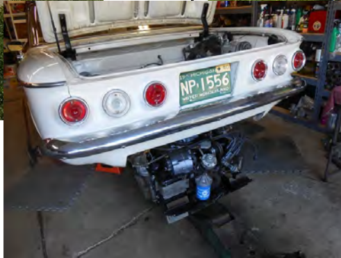
"Stubby" has been around for several years and has changed hands several times. Mods include 5-lug wheels and FC rear axles, to mention a couple. It was recently listed on craigslist and sold to a collector in Southern California.