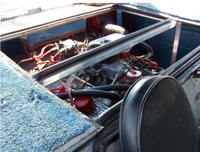
Our own Charlie Evans occasionally saddles up his late model coupe which sports a nice small-block Chevy V-8 and shows it off around town.