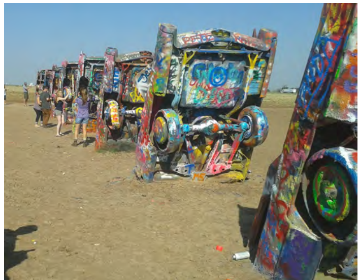
In a recent Corvair hunting trip, several TCA members passed through Amarillo, Texas and were able to visit the Cadillac Ranch.