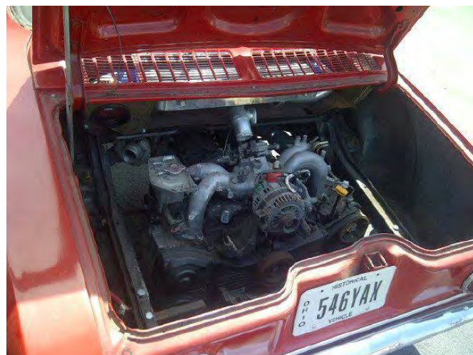
Rear engine arrangement in a late model with Subaru power.

A new Corvairsation index has been added to the Corvairsation page on the Club website. Each article and feature is listed on a Microsoft Excel spreadsheet that is downloadable. When you open the spreadsheet you can find which issue of the Corvairsation the article you are looking for is located. Every issue of the Corvairsation from 2006 to the present will appear on the spreadsheet. The index will be updated as each new issue of the Corvairsation is released.