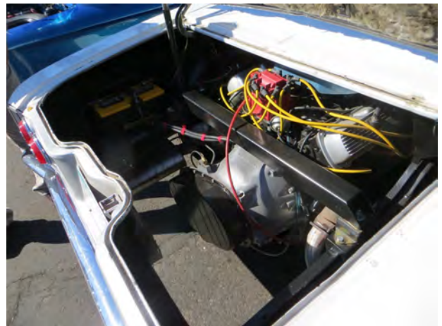
For the person with more dollars than sense, a SBC Rampside may be for you (left). A 455 Olds Toronado drive train fits nicely in this late model coupe (above).