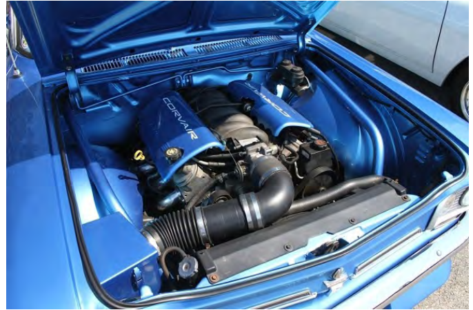
Some prefer their power source in the front of the car. Here are two nice examples of what can be done with Chevy V-8s. The one on the left is using a good old small-block Chevy and the one on the right is power by an LS with nice "Corvair" trim pieces over the valve covers.