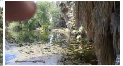
Agua Caliente Park is a very beautiful venue. If you look carefully at the picture above, you may be able to see the Aqua Caliente Monster starting to enter the frame.