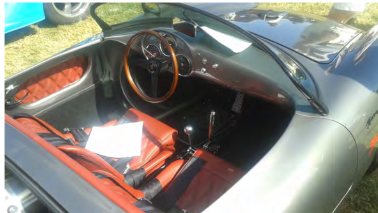
This beautiful Porsche 550 Spyder replica received the third place award in the Air-Cooled class. Go figure.....