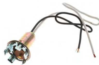
NAPA part number LS 6465 for use on the backup lights.

A recent discussion on the Virtual Vairs forum was about the availability of all metal taillight/backup light sockets to replace the plastic units. The plastic ones have a tendency to come loose and fall out, and don't always make good ground. Several suggestions were made which included putting a #4 sheet metal screw in the plastic housing to hold the grounding shell in place to soldering a wire to the tab and grounding the other end to an adjacent bolt. NAPA sells a couple of Echlin sockets: one for the brake/taillights (p/n LS6469) and one for the backup lights (p/n LS6465). JT&T Products also offers the sockets (p/n 2578F and 2579F). They each have 6 metal tabs which serve to hold the socket secure in place and provide more places to make a good ground. They cost around 5 or 10 bucks per socket but have made several Corvair owners very happy.