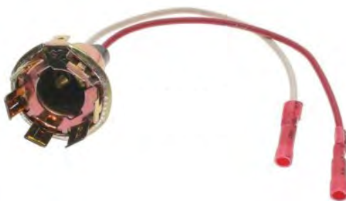
NAPA part number LS 6469 for use on the taillight/brake lights