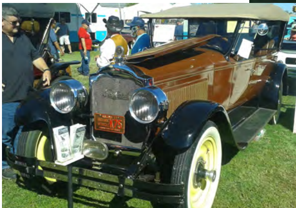
1927 Packard, straight 8 pounding out 37 horsepower! It sold for $7,200 new.