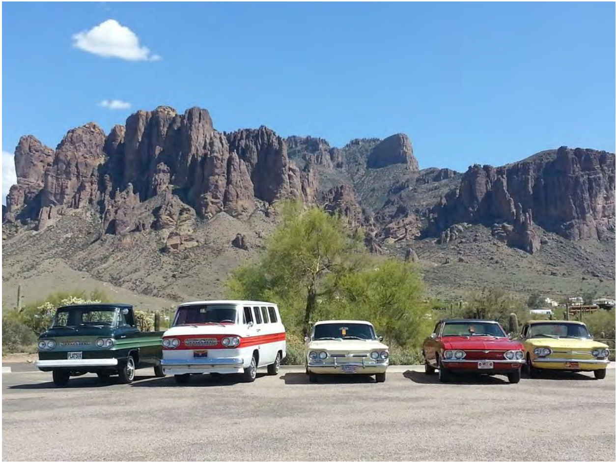
We've shown this photo before but is perhaps the best picture ever taken and deserves to be viewed often. It was taken several years ago at a Cactus Club picnic at the foot of the Superstition Mountains just outside of Apache Junction, Arizona.