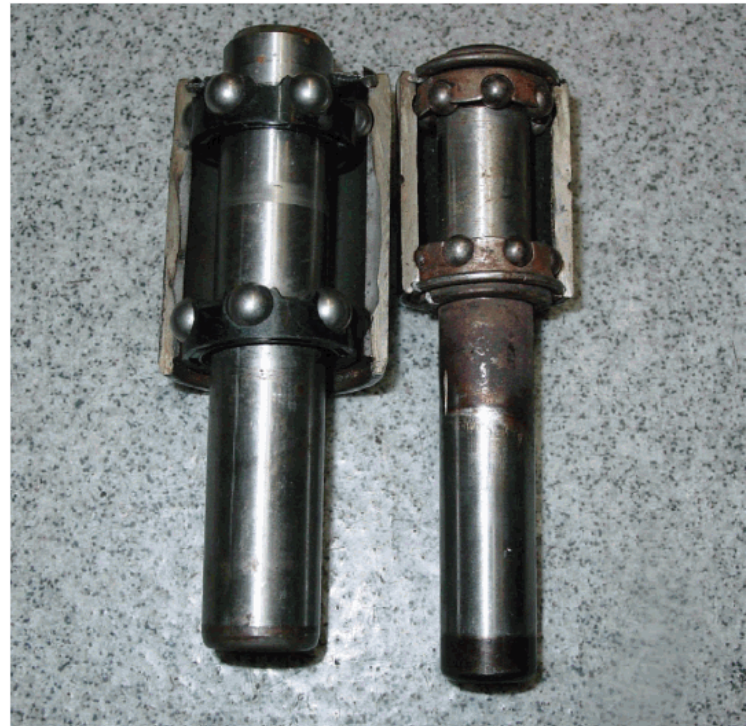
Examples of the late model (left) and early model (right) fan bearings.

You can convert the early style fan bearing to the late style as long as you match up the proper parts. This would be a worthwhile upgrade since the late bearing has larger ball bearings and a larger race diameter. The baffles under the cover were also changed although they are interchangeable. The later baffle is