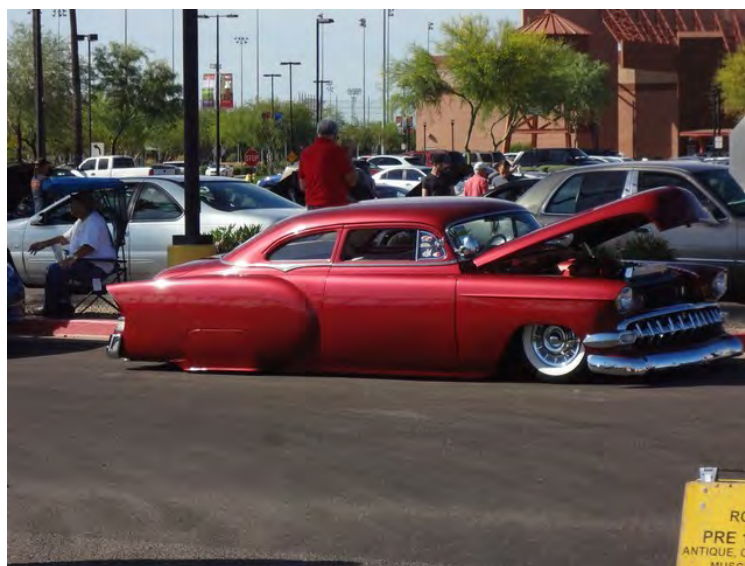
Later in the afternoon the group migrated to the local McDonalds to enjoy the many great cars, including Corvairs, that were on display.