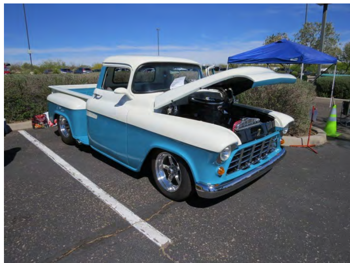
One of the nicest trucks at the Showdown this year.