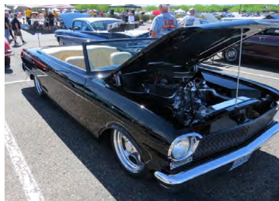
Chevy Showdown pictures