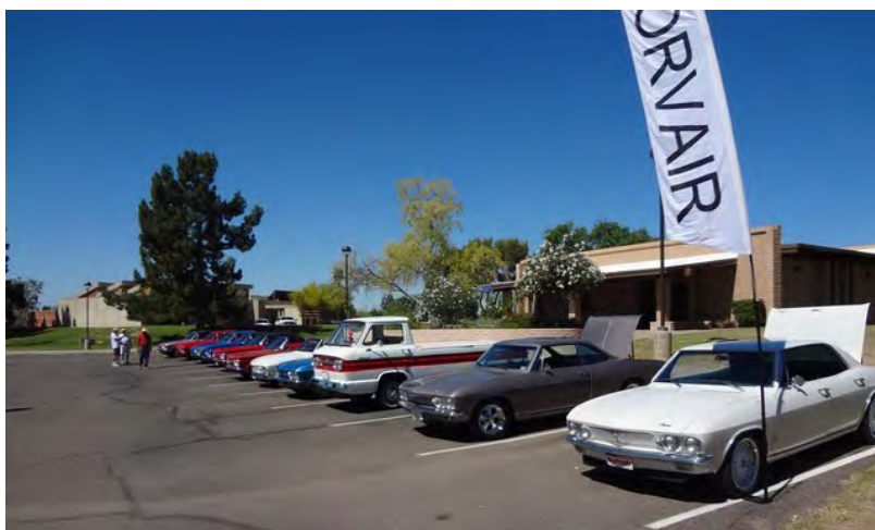
Members of the Cactus and Tucson clubs meet at the Eldorado Park in Scottsdale for good food and games.