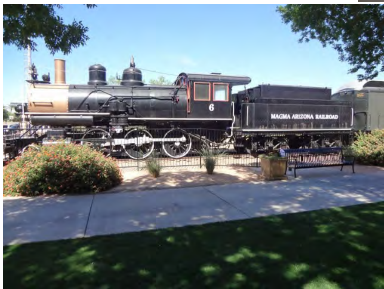
After lunch the group took an outing to the McCormick-Stillman Railroad Park in Scottsdale.