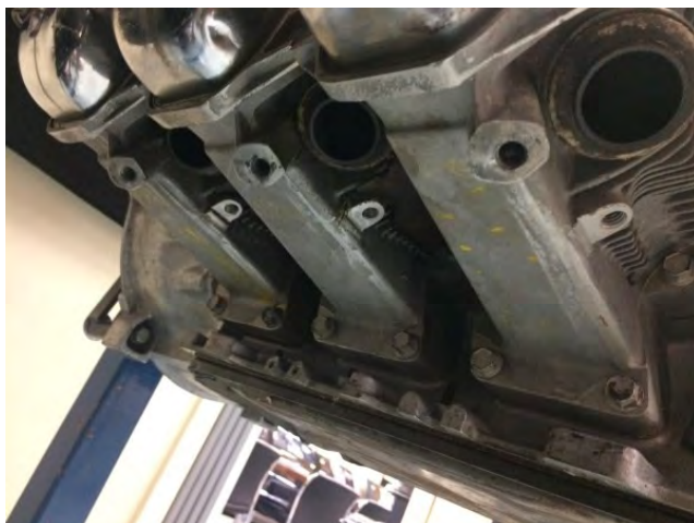
What, no pushrod tubes??