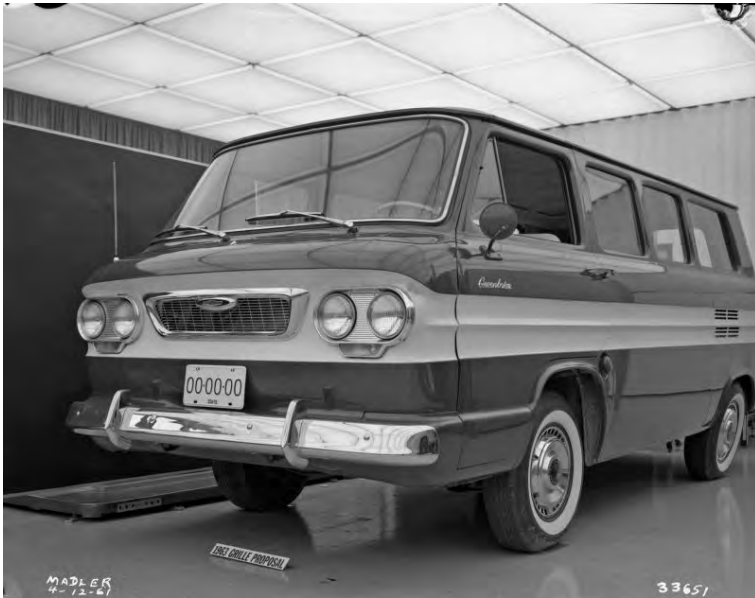
1963 grill proposal